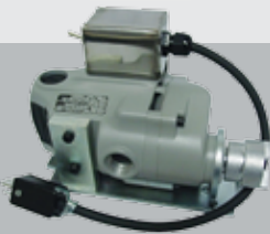
GE Magne-Blast elevating motor