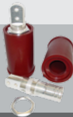
GE Magne-Blast replacement bottles with primary disconnects