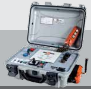
CBS ArcSafe Remote Racking System RRS-3 MB-II purpose-built for GE Magne-Blast