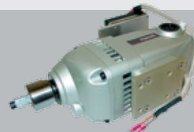
GE Magne-Blast charge motor