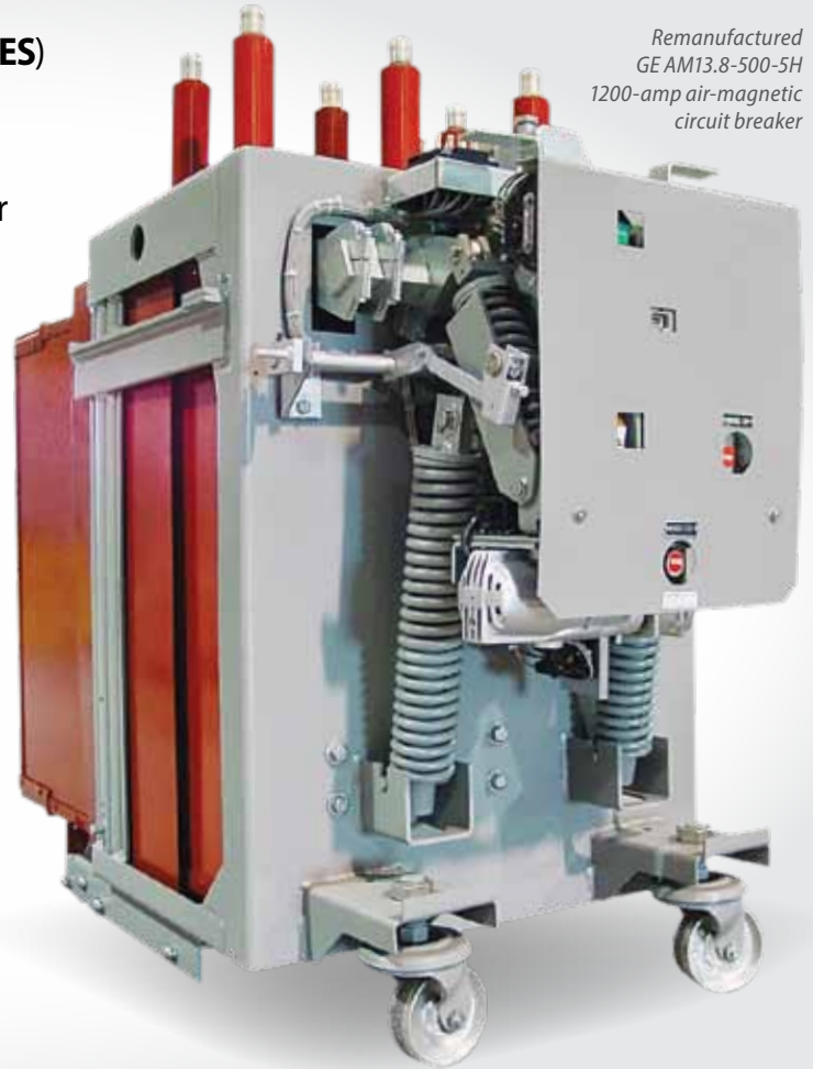
Remanufactured GE AM13.8-500-5H 1200-amp air-magnetic circuit breaker