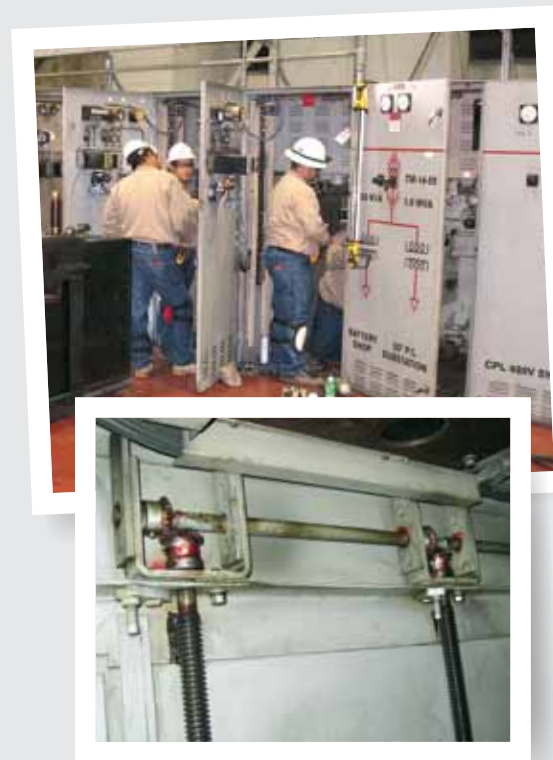
Above: WES's manufacturing capabilities and extensive parts inventory were on full display when it rebuilt all cubicles for more than a dozen Magne-Blast circuit breakers for a U.S. steel manufacturer. Left: GE Magne-Blast AM 13.8-750-2H 2000-amp with VCP-WR element air-magnetic circuit breaker that has been vacuum retrofitted.